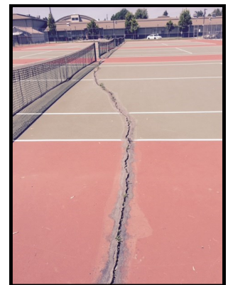
Tennis Court Repairs