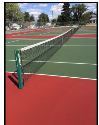
Levy funds are used to maintain our facilities.