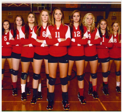
2015 Davenport High School Volleyball ACADEMIC Champs