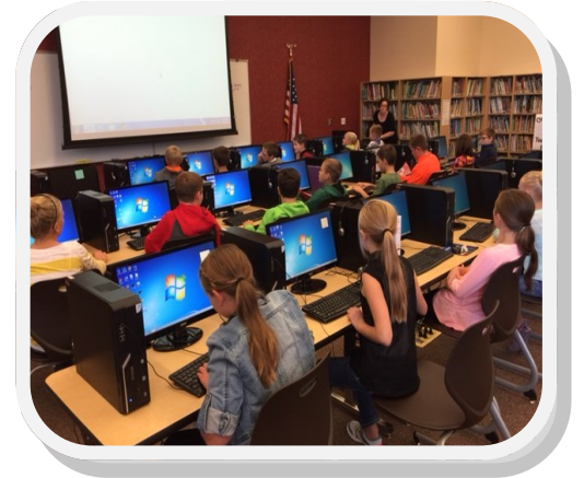
Elementary/Middle School Library and Computer Lab

A. Without levy funds, the District's operating budget would be significantly reduced. In addition to losing levy dollars, we would also no longer receive local effort assistance (LEA), also referred to as levy equalization. These two funding sources make up 20% of our total budget. The loss of these funds would have a devastating impact on our school district. The Board would be required to make significant program reductions and adjustments in order to balance the budget.