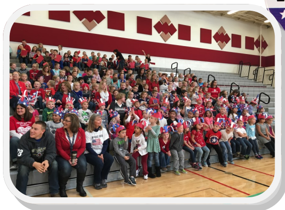
Elementary/Middle School Assembly

A: If you are a senior citizen or a disabled person, you may qualify for a tax exemption. Contact the Lincoln County Assessor's Office at 509-725-7011 for information regarding tax exemptions.