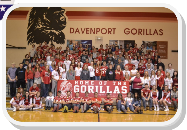
High School Assembly